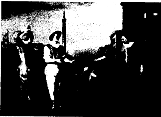
Commedia del Arte

* Apr 4 Lecture: The World as a Stage (1) Reading: Machiavelli: Mandragola