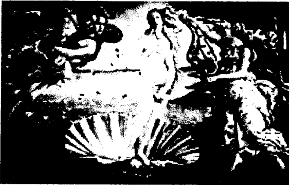
Boticelli: The Birth of Venus