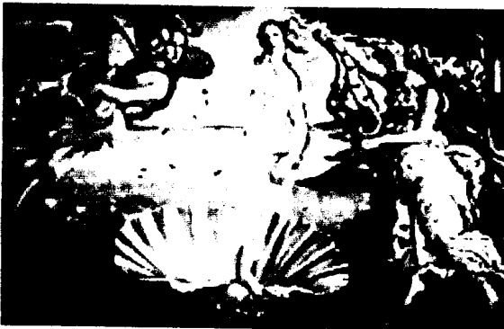
Boticelli: The Birth of Venus