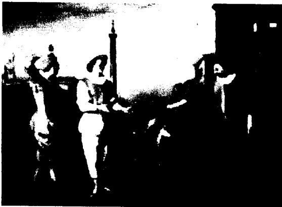
Commedia del Arte

* Nov 13 Lecture: The World as a Stage (1) Reading: Machiavelli: Mandragola